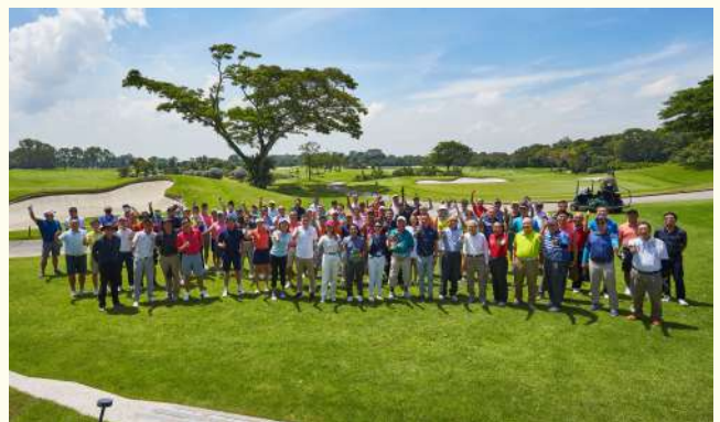
Tampines Course at Tanah Merah Country Club, 27 May 2022

Golfers gathered at The Private Museum's second annual Charity Golf event, raising funds to support the move to the Osborne House at 11 Upper Wilkie Road, a space almost six times larger than our previous location.