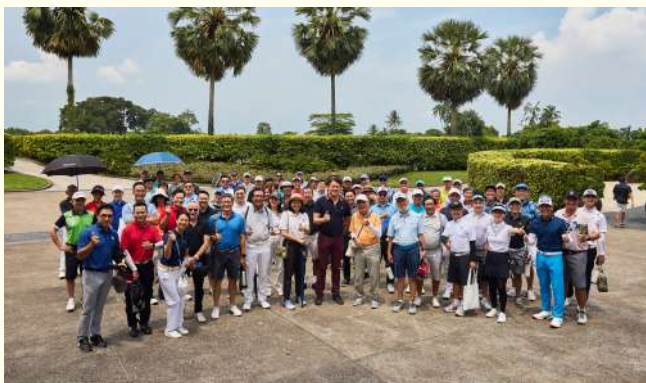
Serapong Course at Sentosa Golf Club, 5 May 2023

The third edition of The Private Museum's Charity Golf took us to Sentosa Golf Club where golfers supported the restoration of our historic new home at 11 Upper Wilkie Road.