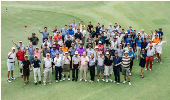
Island Course at Singapore Island Country Club, 5 September 2019

The Private Museum's inaugural edition of the Charity Golf united artistic and creative energies with the precision and drive of the golf course!