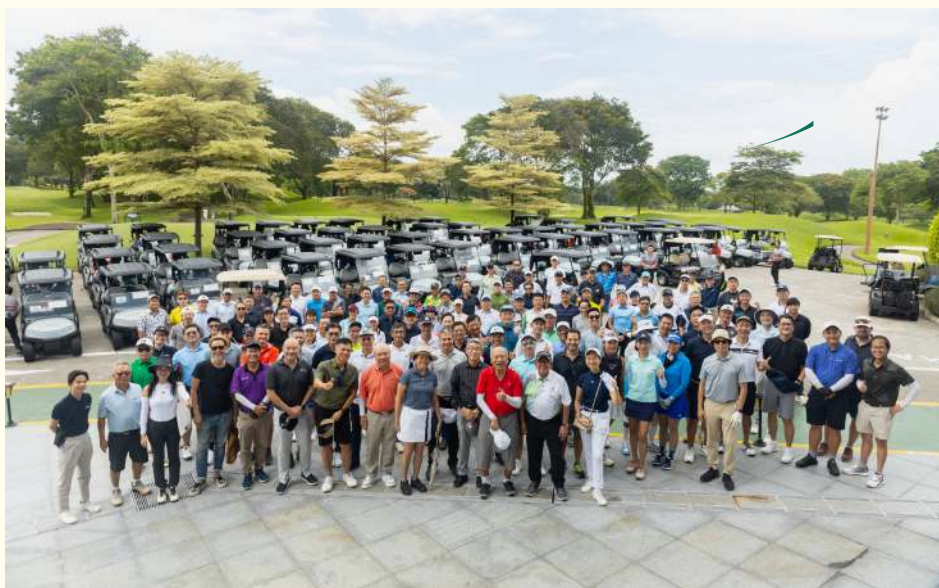
Masters Course at Laguna National Golf Resort Club, 10 May 2024

Last year's Charity Golf raised funds that supported new initiatives in our new home, ensuring the continued success of our diverse exhibitions and outreach programmes.