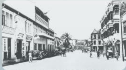
The villa can be seen atop Mount Emily at the end of Middle Road in the 1930s.