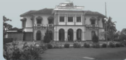
The villa was formerly a Girl's Home run by the Social Welfare Department in 1950s.